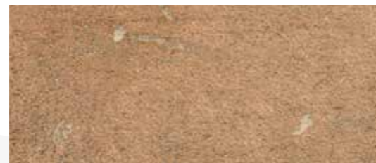
3. The leather acquires a smooth, uniform surface after buffing.