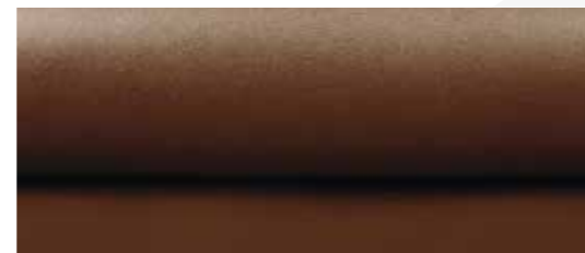
4. Original imperfections in the leather are no longer visible after finishing.