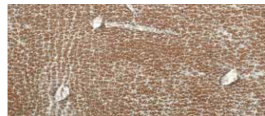
2. Grain-side defects are completely filled through the EUDERM® X-Grade covering.