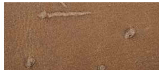
1. EUDERM® X-Grade eliminates small or medium-sized hide defects.